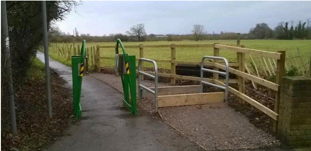
Figure 2 Horse stile BS5709

The BHS does not recommend using suspended scaffold-type poles or metal bars as they are less visible to horses and if a hoof strikes them in crossing, the noise may startle the horse. However, the Society accepts that in some locations wood is too vulnerable to vandalism but poles should not be suspended as a horse's foot may slip underneath causing a serious injury.