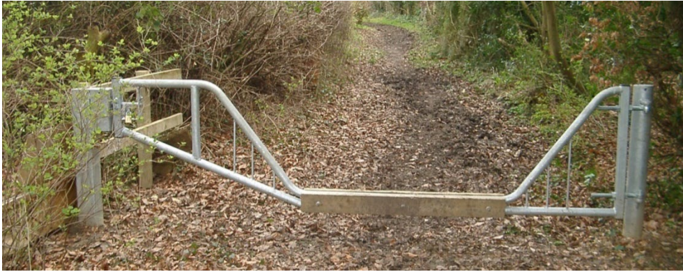
Figure 3 'Horse friendly vehicle barrier' (Centrewire))

A 'horse friendly vehicle barrier' is a term used by a manufacturer for a strong metal barrier with a lowered mid-section over which horses can step. The mid-section must be low enough that it does not encourage a horse to jump it. More robust barriers of the same pattern as that in figure 3 are available.