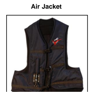
Hybrid Air Jacket