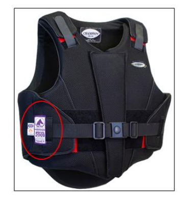
Please Note; these pictures are only intended for illustrating where the BETA label can often be found. A full list of BETA Level 3 body protectors can be obtained from www.beta-uk.org